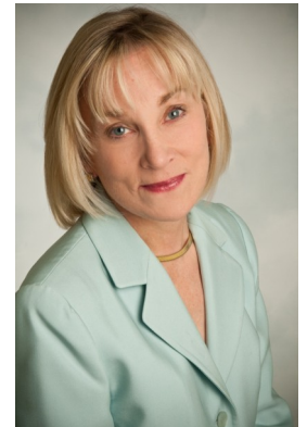
Continued on page seven

Currently serving as the Consumer Advocate for the Certified