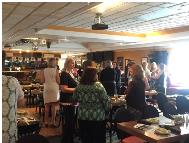
July Networking Meeting at the Tower in Bel Air