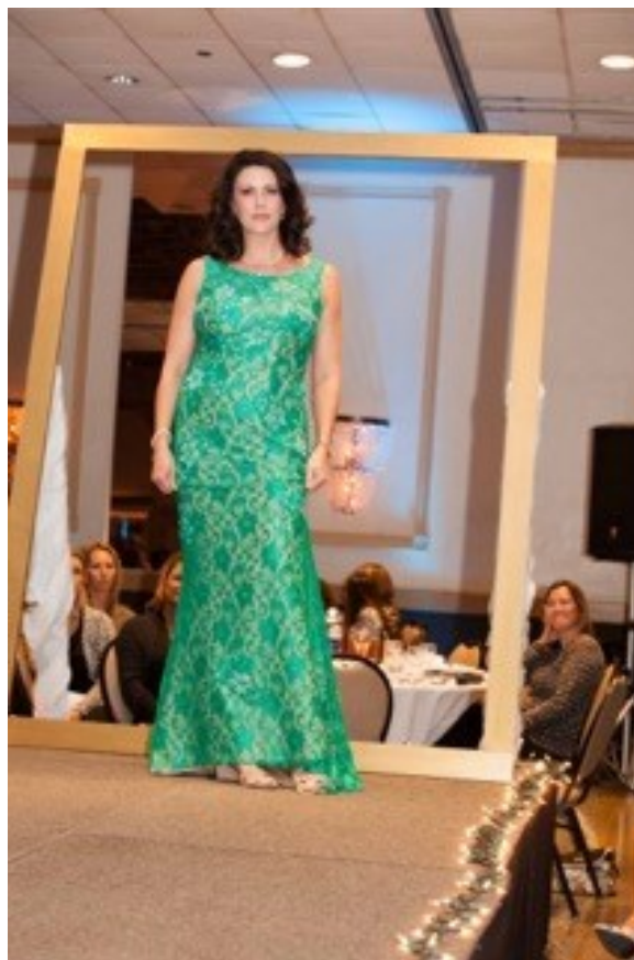
CPWN member strikes a pose at the 17th Annual COWN Fashion Show Fundraise at Richlin Ballroom.